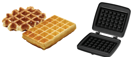
Waffles from Brussels and Liège 4X6 - M001