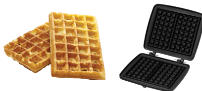
Traditional waffles 4X7 - M002