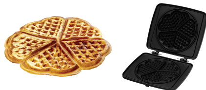
Heart shaped waffles M006