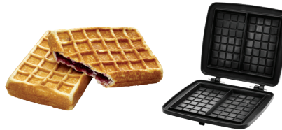
Stuffed waffles 4X7 - M008