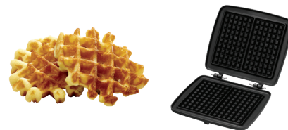
Thin crispy waffles 6X10 - M003