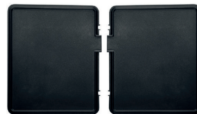
SMOOTH PLATE SET (PLANCHA)