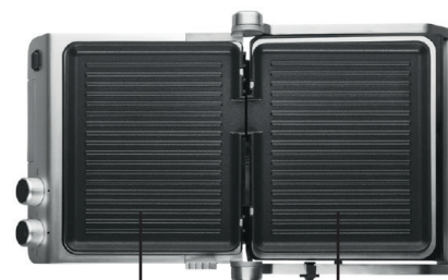
LOWER GRILL PLATE