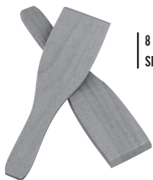
8 WOODEN SPATULAS